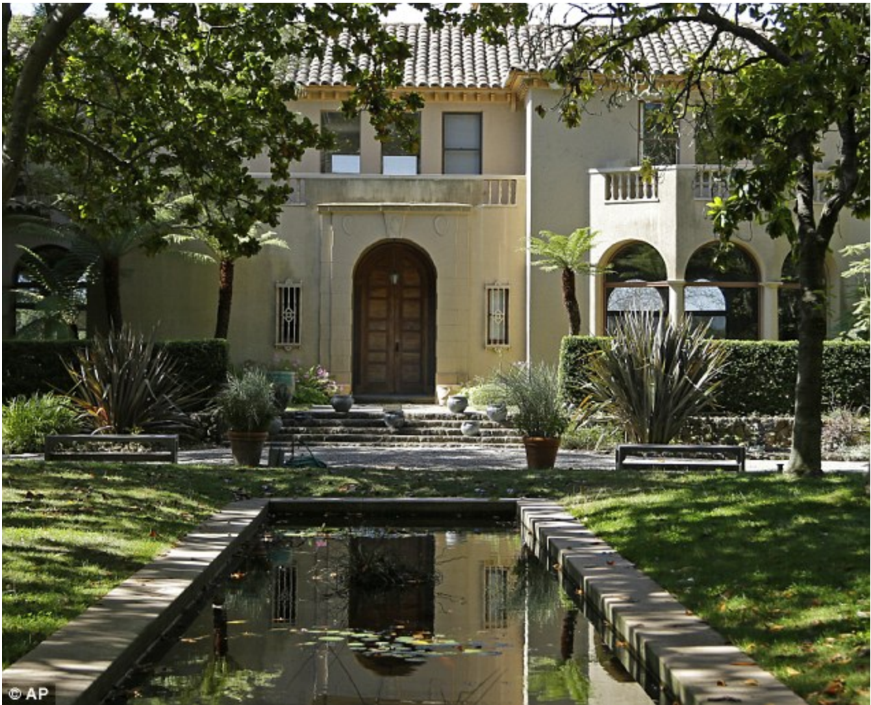
University of California prepares to repair and renovate this 13,269-square-foot mansion, the Blake House, that for decades housed past University presidents. Located in East Bay hills not far from the Berkeley campus, house has been vacant since 2008 and declared uninhabitable following years of neglect

The money will be used to repair the roof and to study if the three-bedroom, seven-bath house and its 10 acres of gardens should again be used as the president's official residence, reconfigured for some other purpose or sold off.