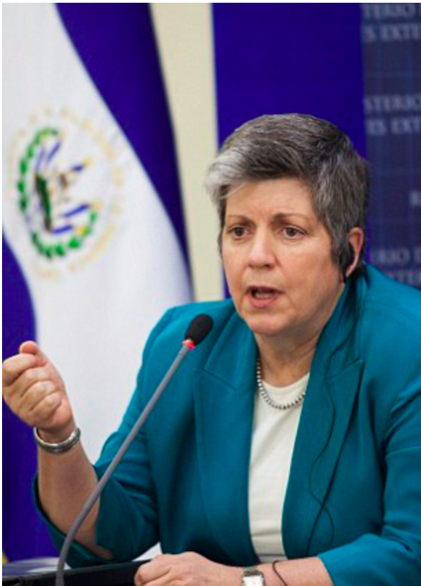
Former U.S. Secretary of Homeland Security, Janet Napolitano is the first female UC president in its 145-year history. She will live in leased house that UC system is renting for nearly $10,000 a month while mansion is repaired for her possible use