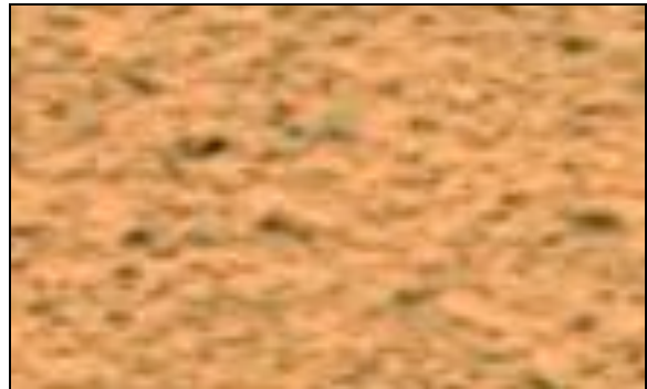
Humanoid bodies on Mars – The woman

In another detail ( below ), the body of a female dressed in a blue dress is visible at center top.