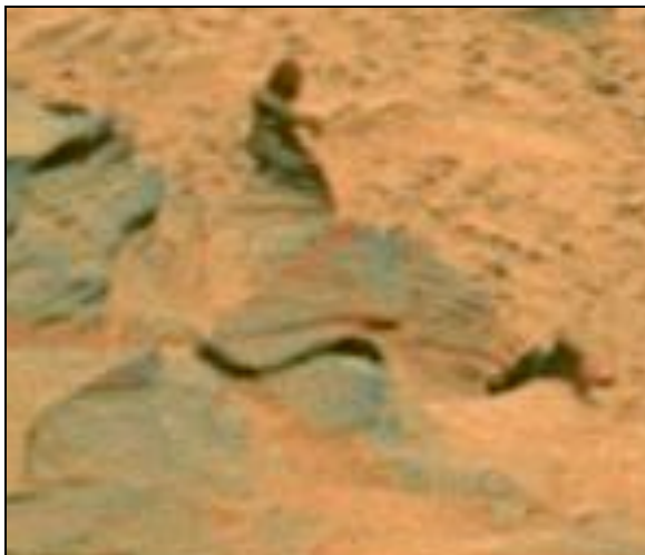
Statue on Mars showing reptile biting human