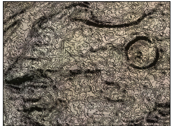
The Barking Dog as a Dragon

Contour filtering reveals the animal's ears to be horns and its head to be rather reptilian ( below ).