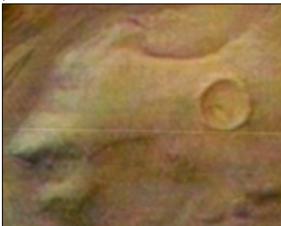
The Barking Dog in the Ruell Vallis of Mars