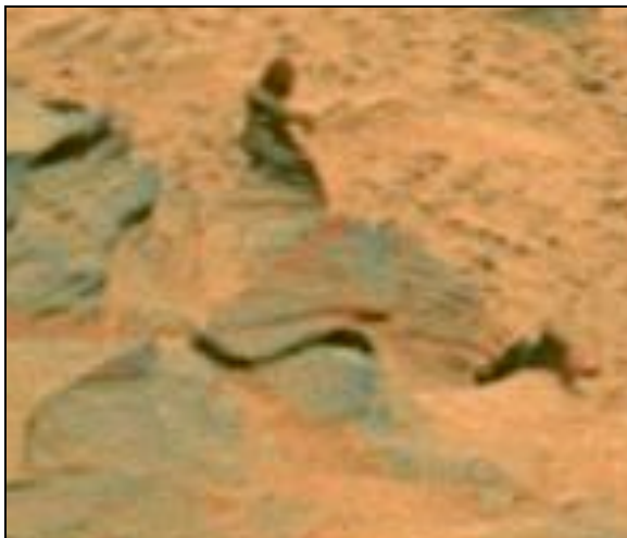
Statue on Mars showing reptile biting human